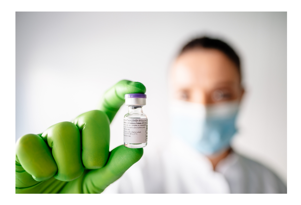
BioNTech SE Quarterly Report of BioNTech SE for the Three Months Ended March 31, 2023