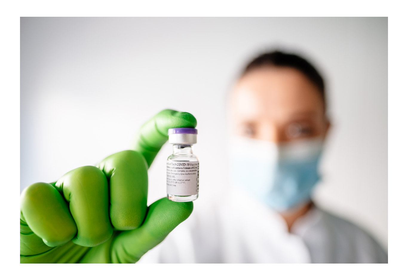
BioNTech SE Quarterly Report of BioNTech SE for the Three And Six Months Ended June 30, 2023