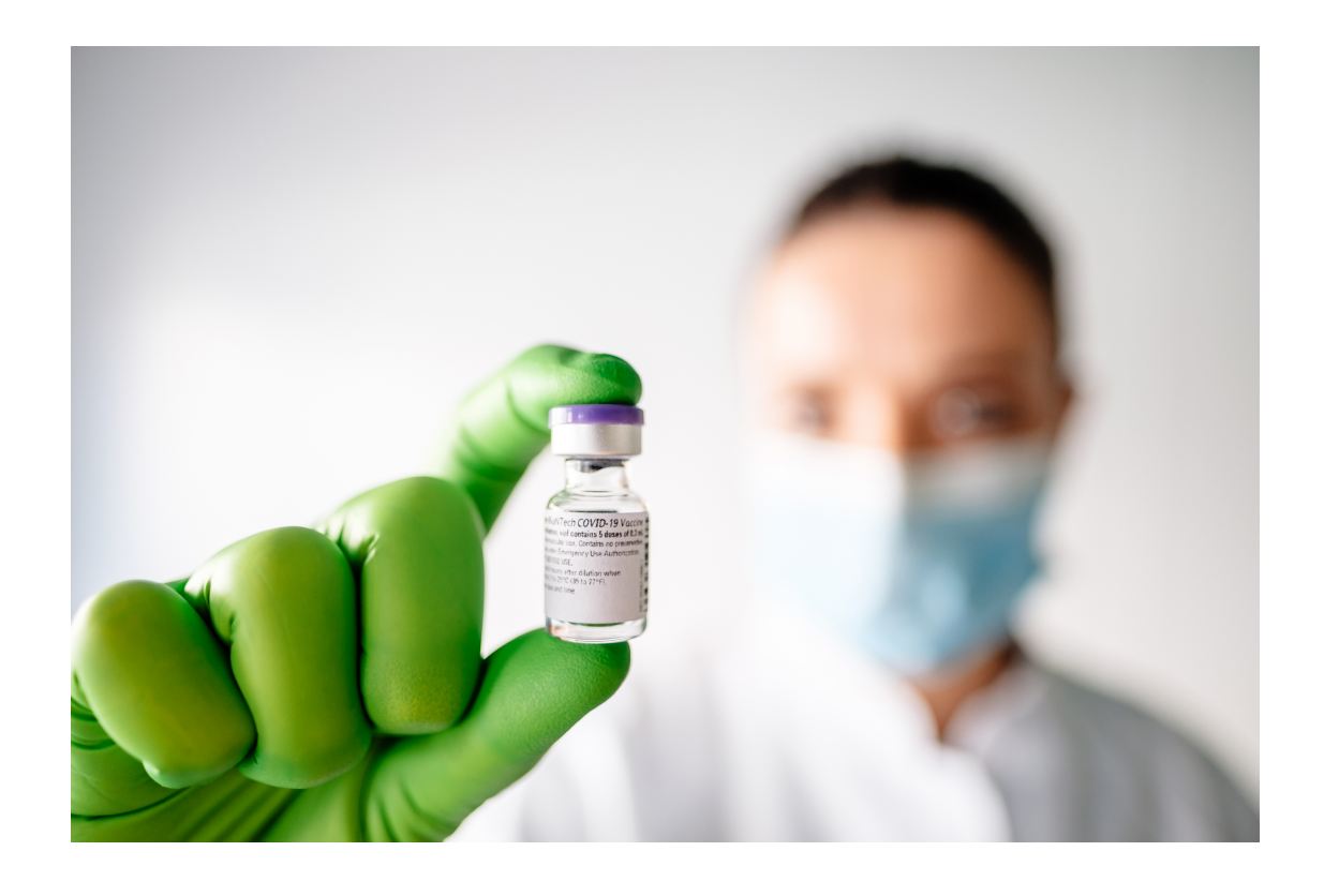
BioNTech SE Quarterly Report of BioNTech SE for the Three And Nine Months Ended September 30, 2023